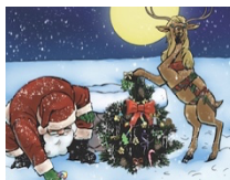
Santa and Wee Tree