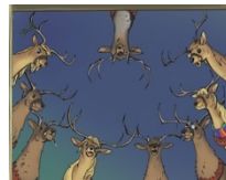
Santa and reindeer on the rooftop