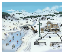
Sleigh and the reindeer